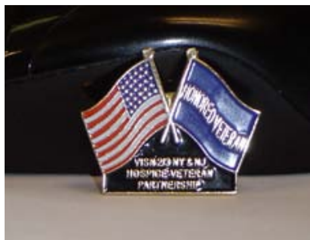
Honorary pin presented to veterans on hospice care

We Honor Veterans is a national hospice provider awareness campaign conducted by the National Hospice and Palliative Care Organization (NHPCO) in collaboration with the Department of Veterans Affairs (VA). NHPCO is actively supporting the campaign and providing resources for hospices to participate because: Of 2.4 million deaths in the United States each year, approximately 680,000 are Veterans. A vast majority of Veterans are not enrolled in the VA and may not be aware of end-of-life services and benefits available to them, including the Medicare Hospice Benefit.