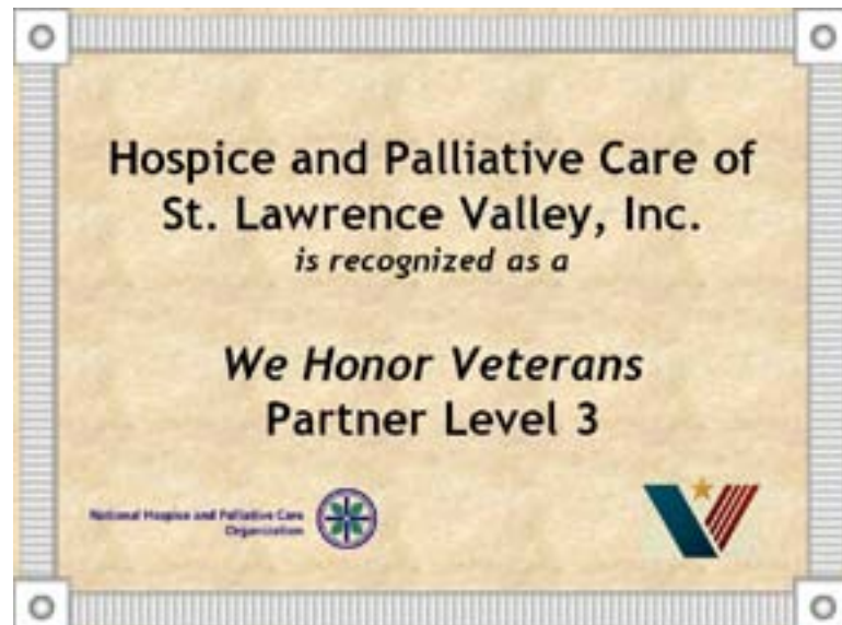
Shown above is the certificate hospice received from NHPCO in recognition of the steps we have taken to ensure high quality care and special recognition for our veteran patients.

Recently, hospice staff assembled a committee including representatives from several area veterans organizations, hospitals and nursing homes to discuss the best ways to educate veterans on available benefits, particularly those related to hospice care. Also discussed were ways to honor veterans through pinning ceremonies while they are enrolled in hospice care.